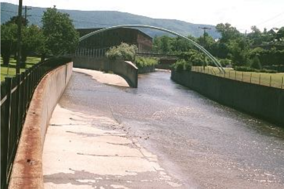
Channeled confluence of the North and South Branches in North Adams.

On Saturday June 26, from 9 a.m. to 4 p.m., at St. Elizabeth's of Hungary Parish Center, Milone and McBroom, an engineering, landscape architecture, and planning firm will lead a discussion on the flood chutes in North Adams – how to preserve their flood control functions while, at the same time, making them recreational and cultural amenities and drivers of economic growth. Many communities around the nation have been able to create 21 st century flood control systems that also benefit fish and other aquatic organisms, allow for appropriate river access, and promote waterfront developments of many kinds.